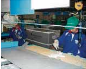
on the air conditioner assembly line as part of Social Science education.