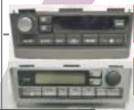
Fully automatic VFD display Fully automatic LCD display