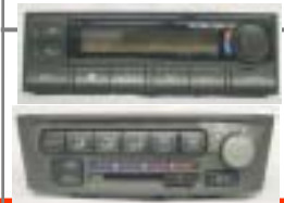
Fully automatic LCD display Fully automatic, without display