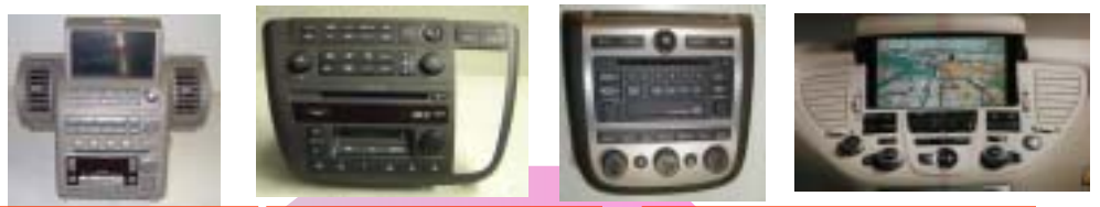
Integrated audio/air conditioner Integrated navigation/air conditioner Integrated audio/navigation/air conditioner

Calsonic Kansei provides a wide range of products from inexpensive, mechanical controllers to centralized switches