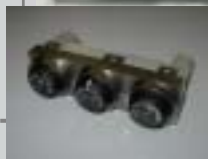
Fully automatic three-series dial